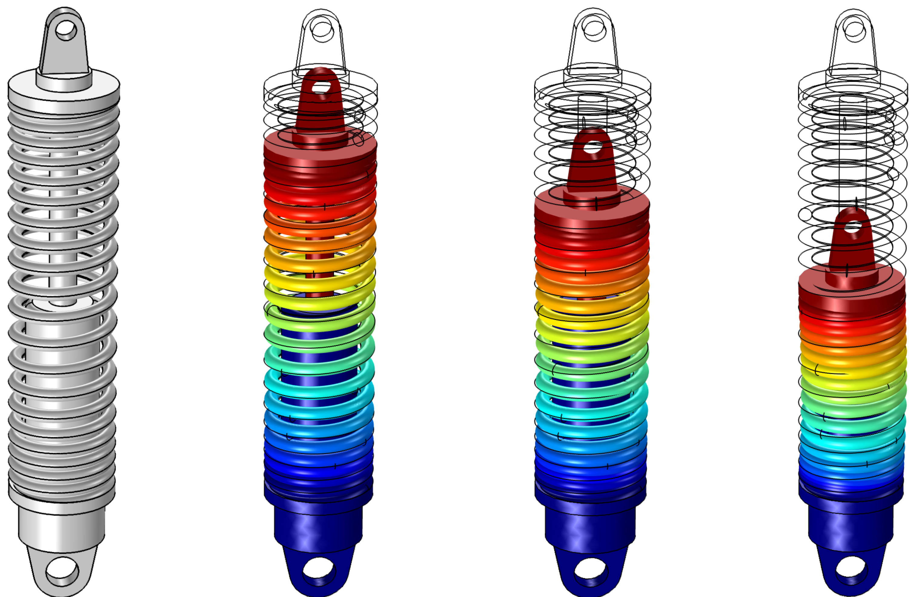
Figure 1. CAE Simulation of Shock absorber

Introduction: A Shock absorber is a mechanical device engineered to absorb impact load and provide ride comfort. This experiment deals with the development of Shock absorber to operate under critical loading conditions. A Conical compression spring is developed to generate negative solid-height, constant spring rate, smooth oscillation and better physical stability. A comparative study is made to distinguish mechanical advantages of Conical spring from Cylindrical compression springs.